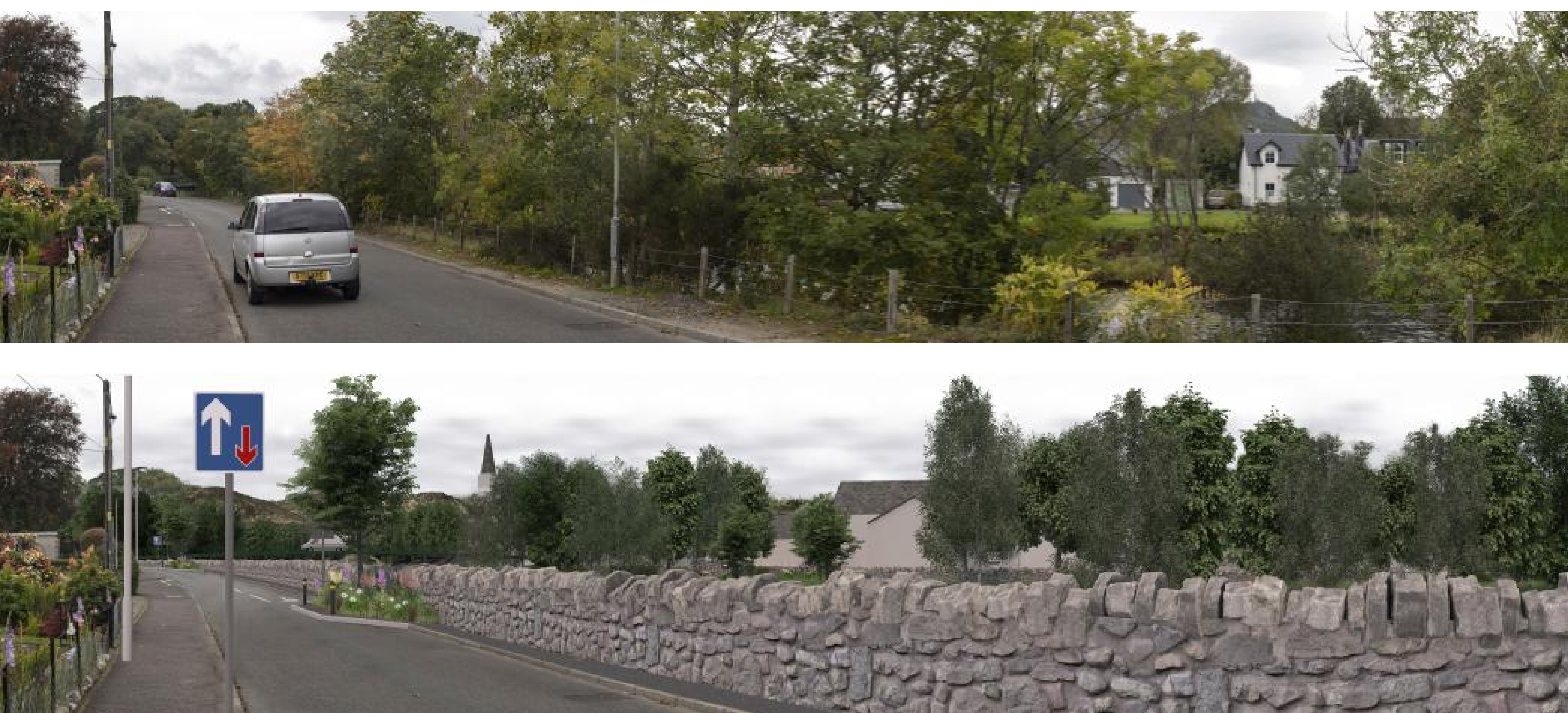
Figure 5: Strowan Road defence visualisation – Present day (TOP) and post-development (BELOW)

Figure 5 indicates how the flood defences may look at Strowan Road.