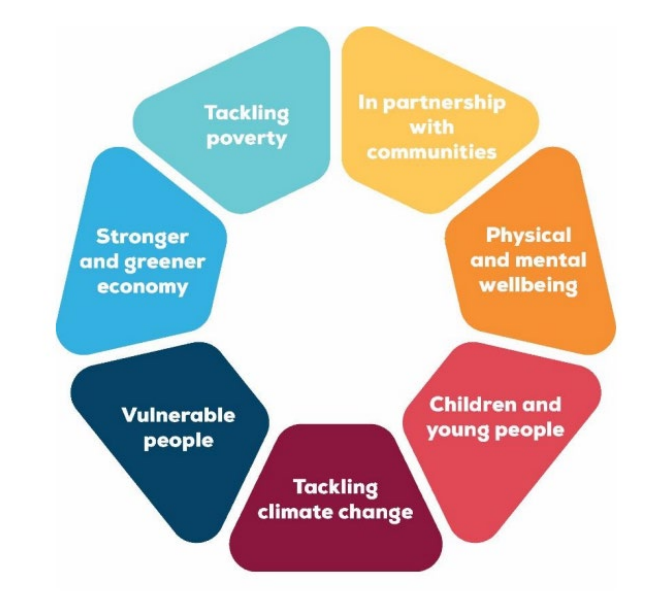
Figure 1: Perth & Kinross Council Corporate Plan Priorities