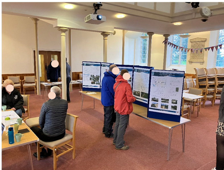
Figure 2-3- View of the Consultation Room

There were also A1 print outs of the proposed scheme's outline design drawings and large maps of the Kinross area available to view and discuss with attendees.