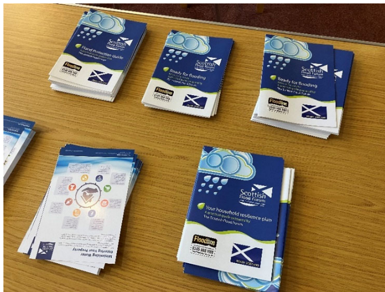
Figure 2-5- Scottish Flood Forum Pamphlets

At the 5 th October 2023 public exhibition, the Scottish Flood Forum were in attendance and provided brochures with details on how the local community can be prepared and protect themselves from flooding (Figure 2-5).