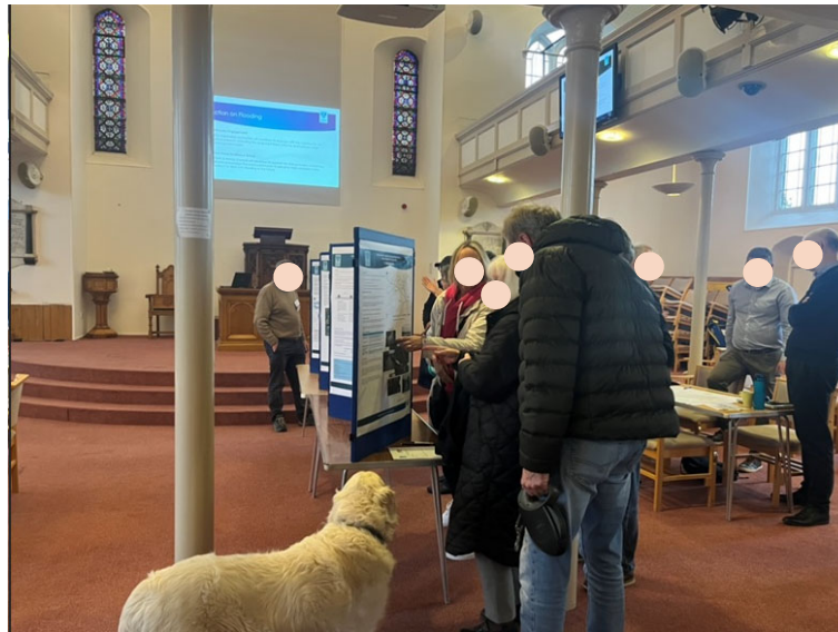
Figure 2-4- View of the Consultation Room with PowerPoint visible

At the 5 th October 2023 public exhibition, the Scottish Flood Forum were in attendance and provided brochures with details on how the local community can be prepared and protect themselves from flooding (Figure 2-5).