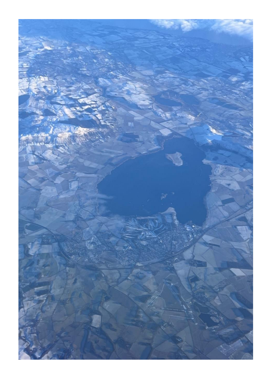
Figure 24 - Aerial View of the Scheme Area

Further information on the proposed flood scheme can be viewed on the Council's website at www.pkc.gov.uk/southkinrossfloodscheme