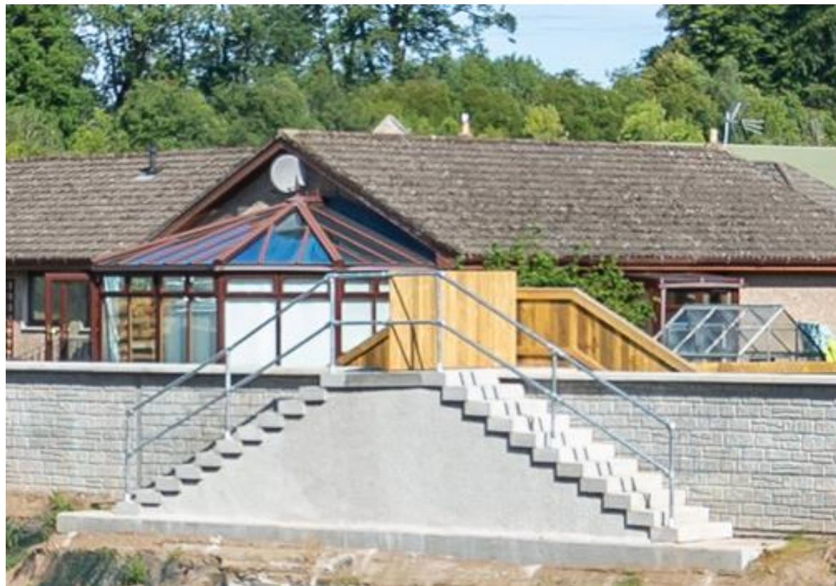
Figure 21: Permanent Maintenance Access