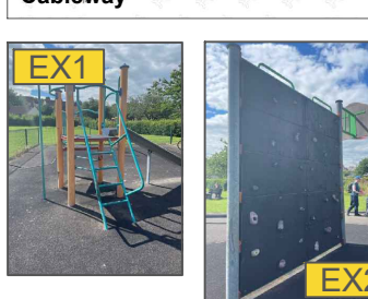
Existing Multiplay Unit & Climbing Wall with Basketball Hoop: Cleaned, repainted and refurbished. Line markings installed on new surfacing.